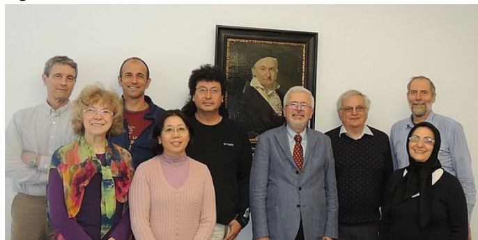
ICMI EC 2013-2016, EC Meeting May 2013, IMU Secretariat, Berlin, Germany

The first meeting of the 2013-2016 Executive Commission took place in Berlin, Germany May 22-24, 2013. The major conclusion reached were the continued expansion of ICMI development activities in the form of the Capacity and Network Project (CANP), the expansion of the Klein Project; ICMI's involvement in the IMU symposium "Mathematics in Emerging nations, Achievements and Opportunities (MENA0)" in August 2014 and to strengthen the cooperation with Springer (ICMI Studies Publishing House). Furthermore the guidelines of ICMI Studies were finalized. Additionally the ICMI channels of communication were reorganized.