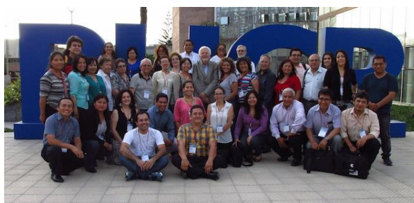
Participants of CANP 5

This influenced the name CEMAS chosen for the network, and indeed CEMAS expects other countries of South America to join so that together they may build a solid network. The CANP5 has received important support from the Institutions of participant countries and CIAEM, but most significantly from the PUCP and the Ministry of Education of Perú that honored the program by sending high-level representatives to the inauguration and closing ceremonies.