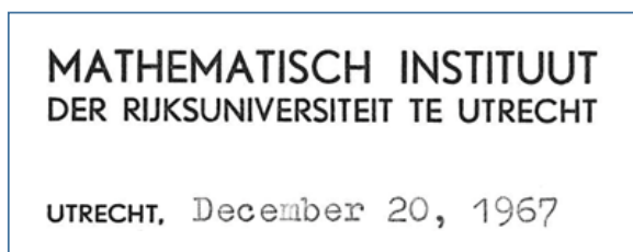
Scan from a letter of Freudenthal [1]

The existence (or absence) of a logo is reflected in particular in the letterhead used in the official correspondence of ICMI officers. For instance, most of the letters which circulated amongst the IMU and ICMI presidents and secretaries during the presidency of Hans Freudenthal (1967-1970) would be either without any letterhead at all, or using the official stationery of the academic institution to which the sender was attached. Here is an example from a letter of Freudenthal to the IMU Secretary.