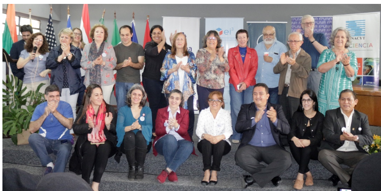
Presenters and local organizers at the closing ceremony, Asunción, Paraguay