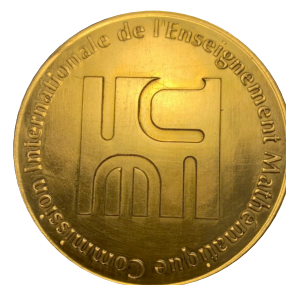
The ICMI medal (reverse side)

Following various calls for comments and suggestions about a “concept” for the logo of ICMI, more than 35 proposals had been received by the EC, heading in very diverse directions. It was far from easy for the members of the ICMI EC to reach a conclusion. Among the criteria for the final decision were issues of simplicity and efficiency of the design, as well as flexibility for the use of the logo in varied contexts (medals, letterhead, posters, book covers, website, etc.).