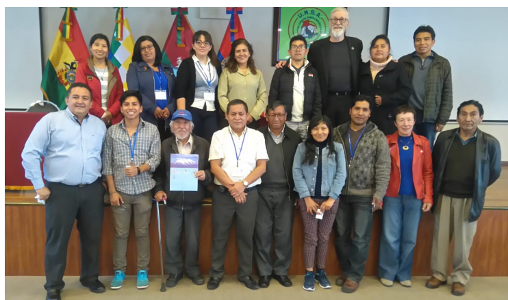
Group photo in the closing session of the meeting in La Paz