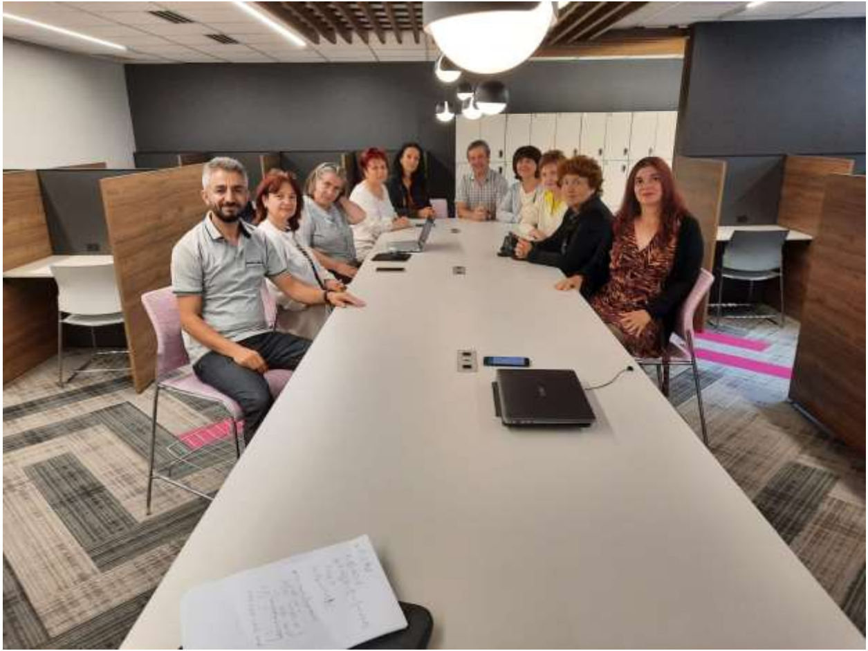
With Romanian visitors at our office at University of Waterloo