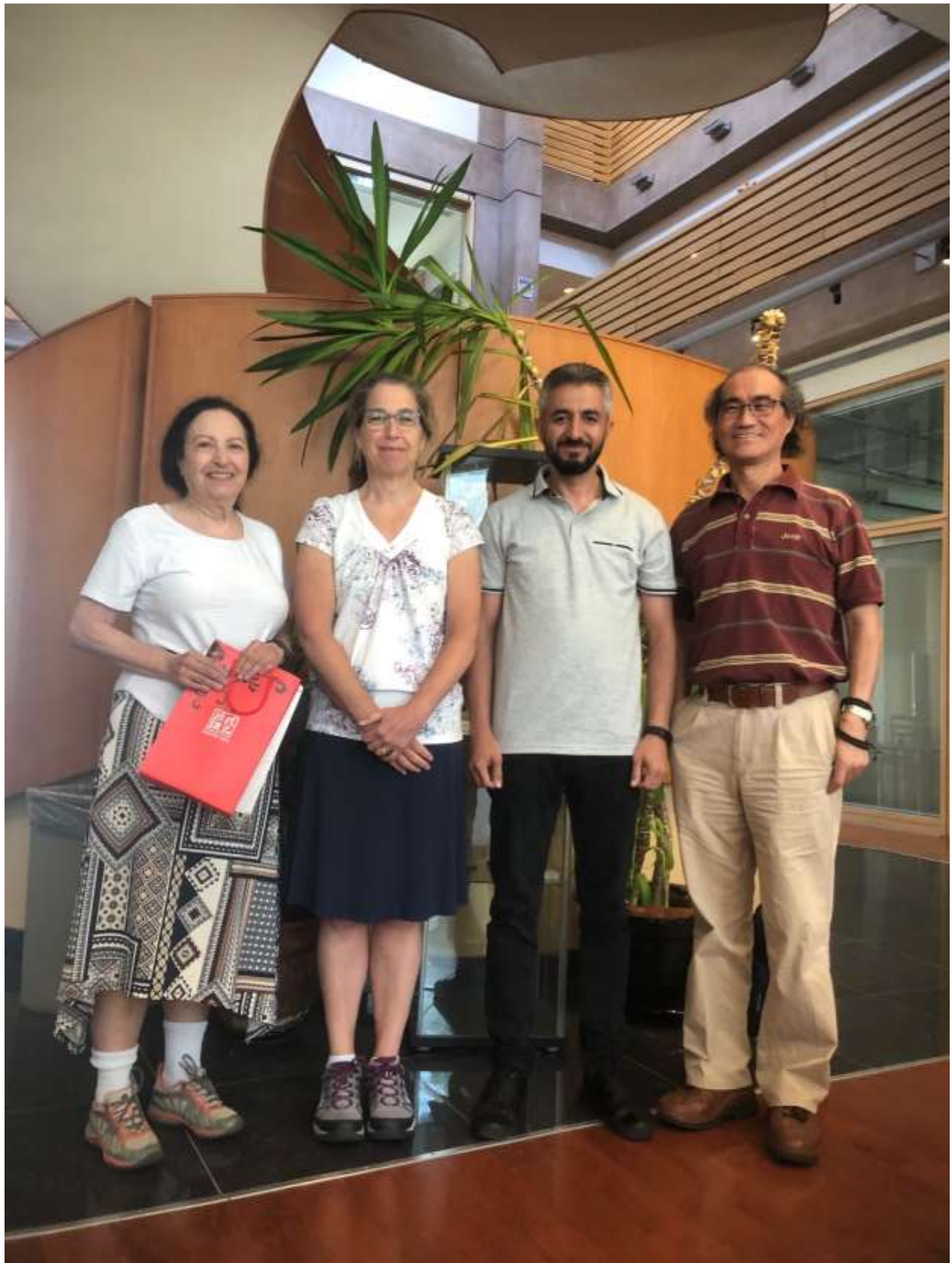
With professors at Fields institute in Toronto