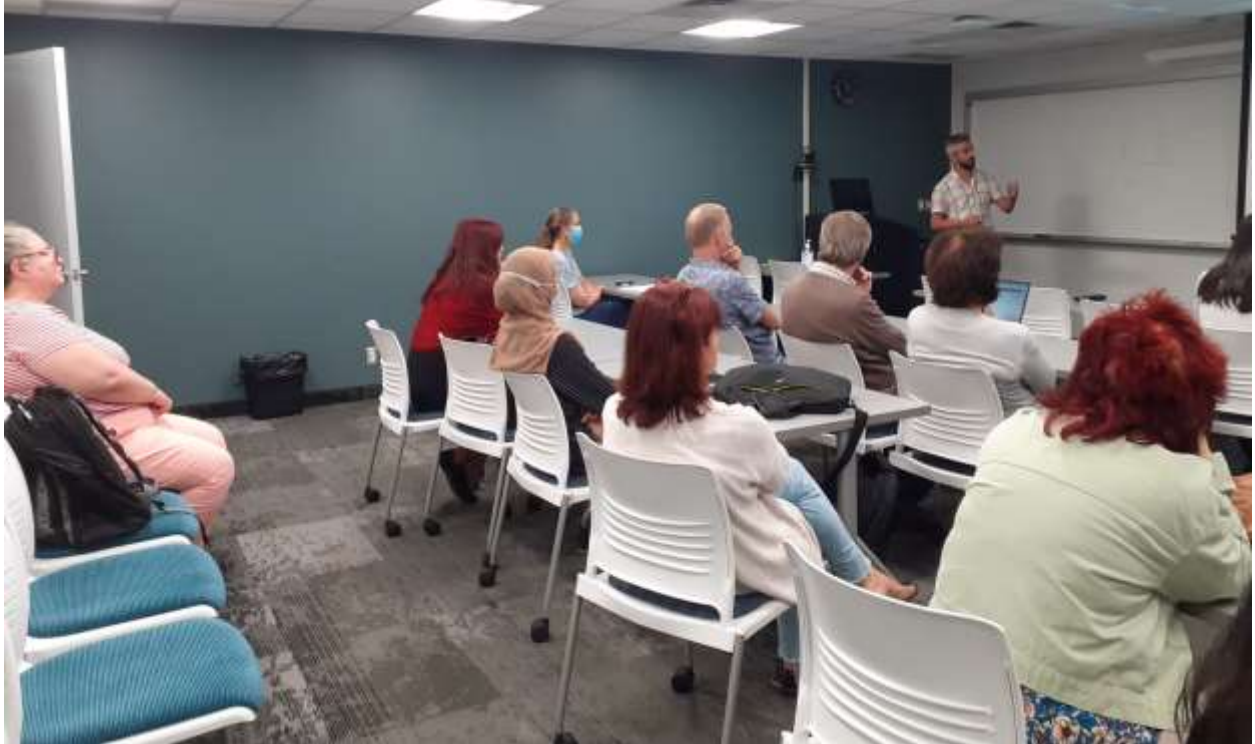
My talk on 21st July 2022 at University of Waterloo