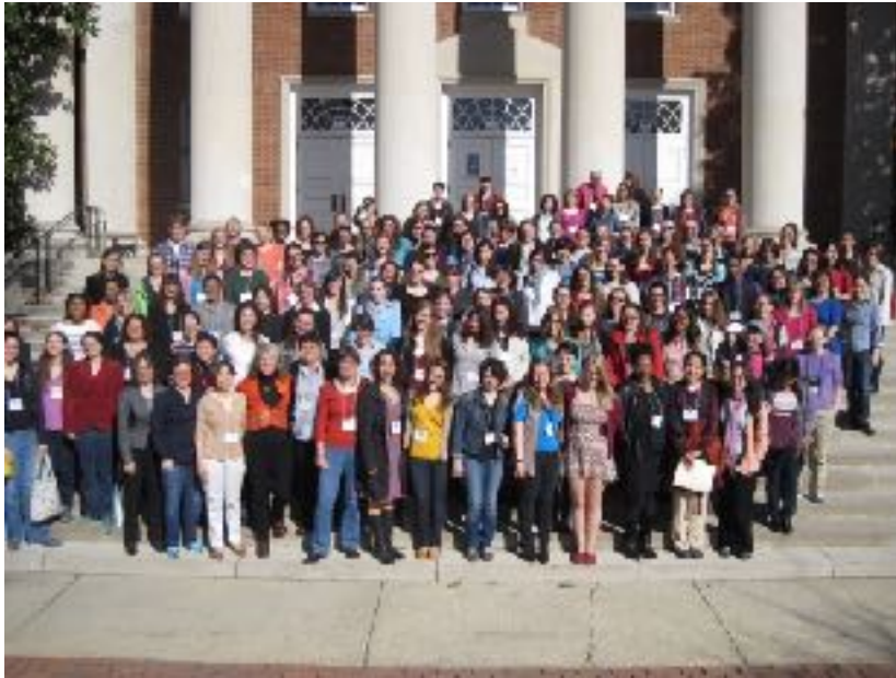
AWM Research Symposium 2015, University of Maryland.

RCCWs are weeklong conferences where junior and senior women work