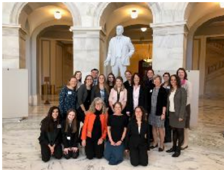
On Capitol Hill: Villanova AWM Student Chapter with AWM leadership, December 2016.