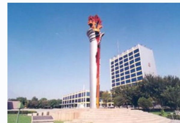
Autonomous University of Nuevo Leon, site of the Congress