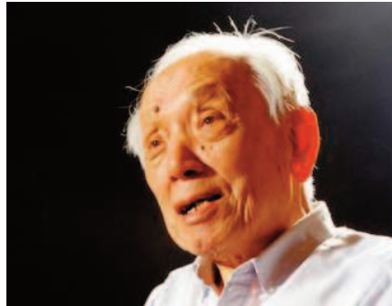
The face of the genius

Louis Nirenberg of Courant Institute of Mathematical Sciences, New York University (NYU). There was a separate ceremony on August 20, to commemorate S. S. Chern, who devoted his life to mathematics, both in active research and education, and in nurturing the field whenever the opportunity arose.