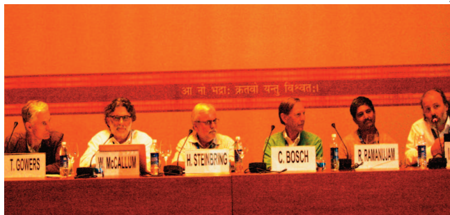
Mathematicians takes part in the Panel discussion.

presentation focused on 'Live Mathematics and classroom processes'. Through his experiences with school children he concluded that there is a big gap between school mathematics and mathematics as a discipline. He added that in many countries people have begun to question the role of mathematics in compulsory school education. He also suggested a need for re-orientation of classroom textbooks and systematic education. By engaging student's attention, every child can be made interested in mathematics.