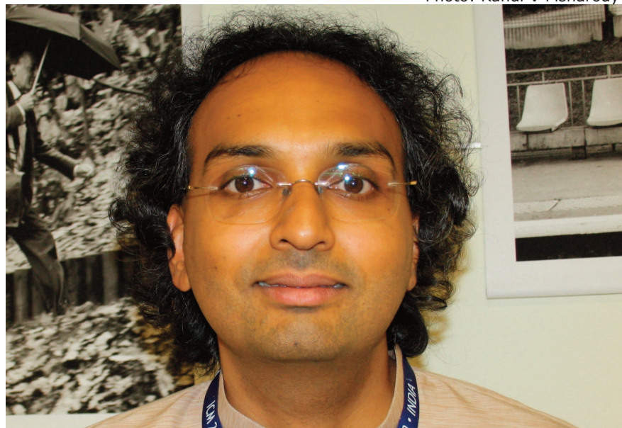
Mathematician, Puzzlist, Cyclist, Juggler, Singer - all in one

There are many mathematicians whom I've looked up to over the years. If I had to pick one, it would probably be Jean-Pierre Serre, who was the youngest Fields Medalist. He introduced many different ideas into many different areas of mathematics – topology, algebraic geometry, complex analytical geometry, number theory...He thought deeply about many different areas of mathematics. He was able to transfer important ideas from one area of mathematics to another. He gave many of the ideas that led to growth in these great the-