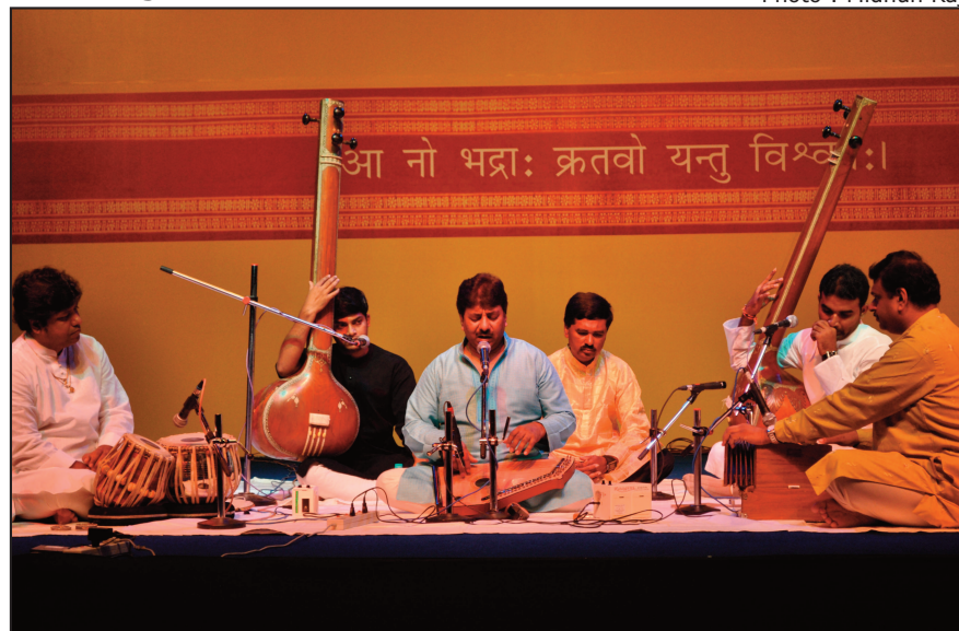
Ustad Rashid Khan sings at ICM 2010