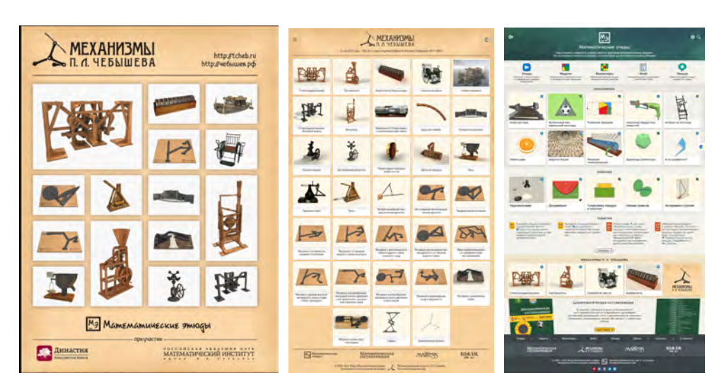
Left and center: Mechanisms of Tchebyshev DVD cover and web page Right: Mathematical Etudes webpage

The addiction of today's children to smartphones opens up new opportunities to popularize mathematics. For example, the Euclidea app (https://www.euclidea.xyz/) presents a modern and unusual approach to studying geometry. Instead of memorizing theorems and ready-made recipes for geometric constructions, you discover the properties of figures and their relationships on your own: by trial and error, by applying logic and intuition and by studying dynamic drawings. Euclidea requires you to solve problems using the smallest possible number of moves, which turns even standard problems into mindbenders.