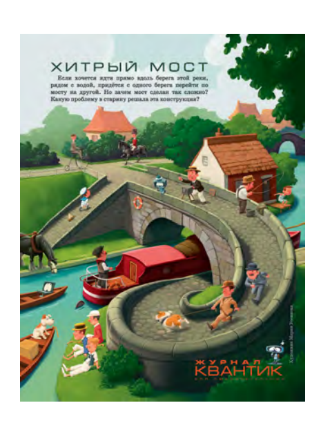
A back cover of Kvantik with a "picture-problem"

In 1970, "Kvant" or "Quantum", a popular physics and mathematics magazine, saw the light for the first time <a href="https://kvant.ras.ru/">https://kvant.ras.ru/</a>. The publication was designed for schoolchildren, and its first editors-in-chief were prominent Russian scientists: the physicist I. I. Kikoin and the mathematician A. N. Kolmogorov. Articles for the magazine were written by teachers and prominent mathematicians. With a circulation of several hundred thousand, it reached many schoolchildren often becoming the gateway to serious science. It also had a monthly problem section, and schoolchildren could send in the solutions, which were checked and graded. An associated series of popular books "Kvant library" published many excellent popular introductions to science.