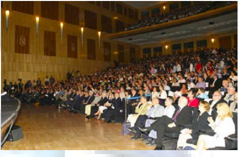
Opening Ceremony ICM 2006, Madrid

The proceedings of all International Congresses have been digitized and are available free of charge from the web page